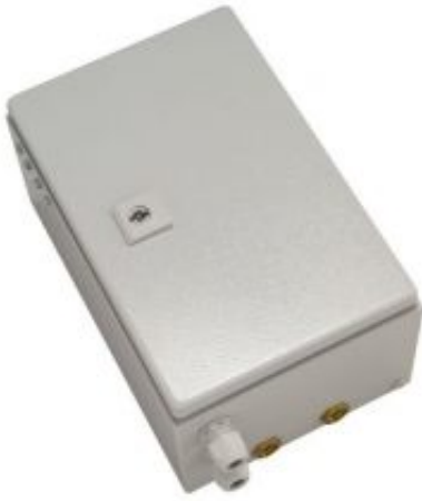
Mechanical CO2 Release Panel RS10.014