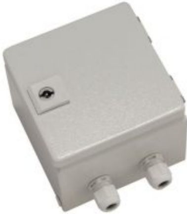
Electrical CO2 Release Panel RS08.011