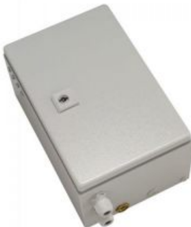
Mechanical CO2 Release Panel RS10.022