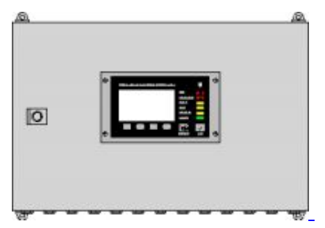
CP-100 in Module Cabinet MC-308