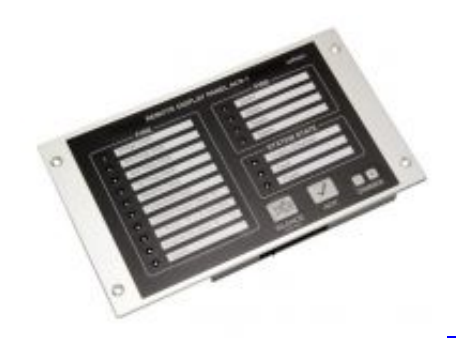
Remote Display Panel for ACS-1-FD